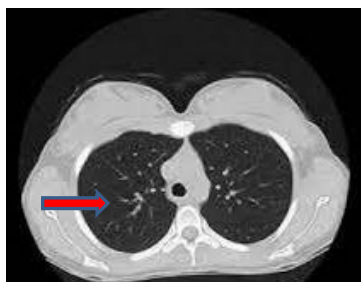
Figure 1. Spiral Computerized Tomography. Note. Spiral computerized tomography was performed and mild plural effusion addition to bronchiole wall thickening was detected.

pleural effusion addition to bronchiole wall thickening was detected as well (Figure 1). Laboratory data are provided in Table 1.