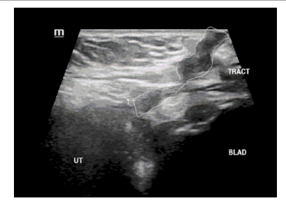
Figure 1. Ultrasonography Showing the Fistulous Tract.

Most cases of uterocutaneous fistula have been observed after classical cesarean section and other gynecological surgeries due to improper closure of the uterus and the layers of the anterior abdominal wall or drains left behind due to post-partum hemorrhage. However, an uterocutaneous fistula seen after a myomectomy in nulliparous women is extremely rare. Postoperative infections weaken the sutures and prevent proper approximation of the tissues. Tuberculosis has also been known to cause uterocutaneous fistulas (3). The most common symptoms associated with an uterocutaneous fistula are chronic discharge from the wound site and abdominal pain. The depth of the fistula is generally measured using imaging modalities such as ultrasonography, fistulography with a contrast dye, CT scan, and MRI. Among these imaging modalities, contrast-enhanced MRI provides proper delineation and