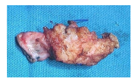
Figure 5. Excised Fistulous Tract.