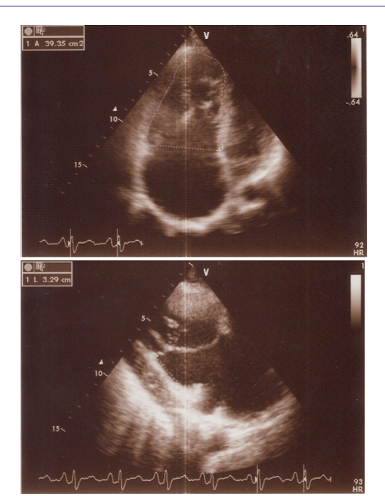
Figure 3. Echocardiography (TTE and TEE) showed: Typical Ebstein anomaly, small LV cavity with under filled and mildly reduced systolic function, Right ventricle is partitioned to atrialized RV & functional RV, FRV/TRV=40%, Left atrium size is normal, Right atrium size is enlarged, Tricuspid valve has displacement of posterior leaflet to apex (6.37 cm) and displacement of septal leaflet to apex (5 cm) with severe TR and normal PAP. Inter atrial septum has secundum type ASD at fossa ovalis (size=1.4 cm) with left to right shunt. Pericardium is normal.

depending on maternal cardiac dysfunction (7).