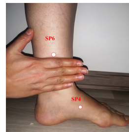
Figure 1. SP4 and SP6 Points

A gynecologist visited the participants with self-reported primary dysmenorrhea. If the primary dysmenorrhea was definitely diagnosed, the participants who matched the inclusion and exclusion criteria were assigned randomly