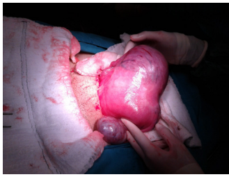
Figure 1. Placenta Accreta (PA) Located in the Right Part of the Uterus.