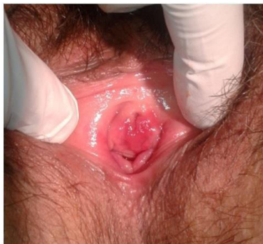
Figure 1. Erythematous Patch in the Vaginal Mucous Membrane and Vestibule.

We dismissed the infectious and neoplastic causes, as well as other common disorders such as lichen planus or pemphigus vulgaris and we thought that it could be DIV. We prescribed 2% clindamycin cream, 4 to 5 grams intravaginally, once daily for 4 weeks following with hydrocortisone ovules, 0.01 grams per ovule, once daily for 2 weeks. The patient showed a considerable clinical improvement in the follow-up examination after 4 months.