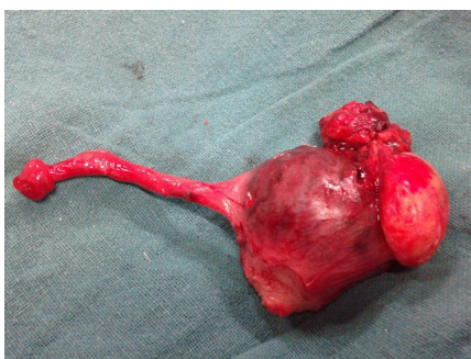
Figure 2. Post-operative picture of the specimen of resected rudimentary horn along with the ipsilateral tube.

Unicornuate uterus with a RH often presents with recurrent first trimester abortions (5%-10%), a second trimester loss (25%), or is incidentally discovered during an infertility work-up. There may be wide spectrum of clinical presentation ranging from a trivial dysmenorrhea in adolescence to intractable vague pelvic pain in a parous woman (2). Hematometra is uncommon due to lack of menstrual shedding from associated aplastic or hypoplastic endometrium. However, our patient had normal gynecological history with previous normal reproductive outcomes.