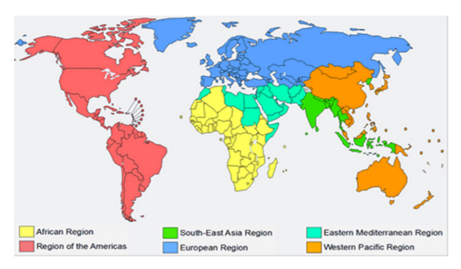
Figure 1. Map of the Eastern Mediterranean Region. Note . The definition adopted in the review included Afghanistan, Bahrain, Djibouti, Egypt, Iran, Iraq, Jordan, Kuwait, Lebanon, Libya, Morocco, Oman, Pakistan, Qatar, Saudi Arabia, Somalia, Sudan, Syria, Tunisia, the United Arab Emirates, and Yemen.

Country profiles and related reports to this research were obtained through the United Nations Department of Political Affairs (UNDPA), United Nations Children's Fund (UNICEF), United Nations Development Programme (UNDP), WHO, and the World Bank websites. Then, a literature search was performed on several scientific databases including PubMed, Scopus, Science Direct, and Google Scholar. Additionally, the reference lists of the included studies and relevant reviews were searched for eligible studies. Following the definition proposed by the WHO, maternal mortality was considered as the death of a woman during pregnancy or up to 42 days after delivery irrespective of the site and duration of the pregnancy.